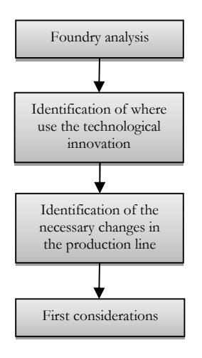
Fig. 1. Research approach

The research approach (see Fig. 1) is therefore based on a first foundry analysis to know the manufacturing processes. The second step consists in understanding, based on the particular production processes, where it is possible to replace the organic binders with the inorganic ones proposed by the Green Foundry LIFE project. The third step consists in identifying the changes generated in the production process by the use of new binders. Finally, some considerations are made.