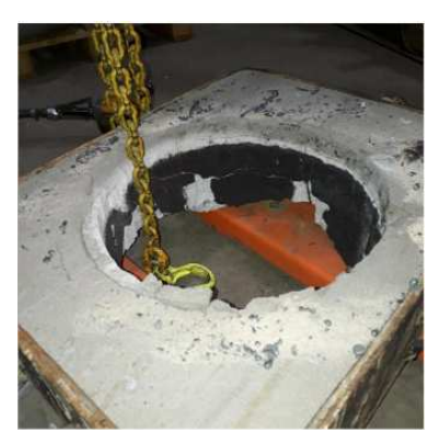
Photo 8. Chamber test mould after cooling. Black burned sand around the casting.

The test mould was broken manually and the amount of loose material was collected and measured. There was around 1,5 mm thick burned black sand area around the casting, see photo 8.