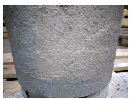
Photo 38. Surface quality of the chamber test casting (after sand blasting), no coating was applied.

The test casting was sand blasted and the weight 204 kg. The surface quality of the test casting was poor, photo 38. The reason was that no coating was used. Previous tests have shown that by using alcohol-based zirconia type coating in the moulds made by inorganic binder system nr 2. the surface quality was as good as the castings made by using organic Alphaset binder systems and the same coating.