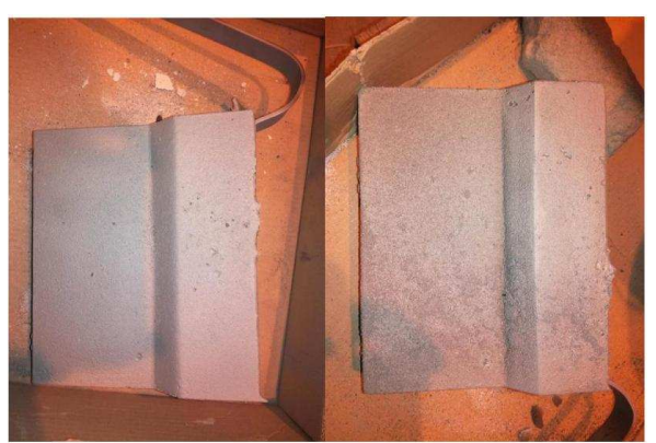
Photo 19. Test cast from coated mould, left, and from uncoated mould, right.

The results of the pretests with inorganic binder system nr. 2 were promising. The needed strength levels were achieved without any excess drying or heating treatment and the surface quality with alcohol based Zr coating was good. It was decided to proceed with this binder nr 2 into production scale test casts. It was also decided to make a chamber test to measure the total gaseous emissions from the mould, because this binder system includes organic agent, ester-based hardener. The representative of the binder manufacturer expected that the gaseous emissions would be under 10% of the emissions compared to the organic Alphaset moulds.