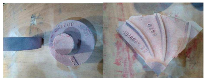
Photo 47. Dye penetrant inspected test castings. No cracks or gas porosity holes.

DPI did not reveal any cracks or gas porosity holes in the test casts. Examples of the test castings are shown in photo 47.