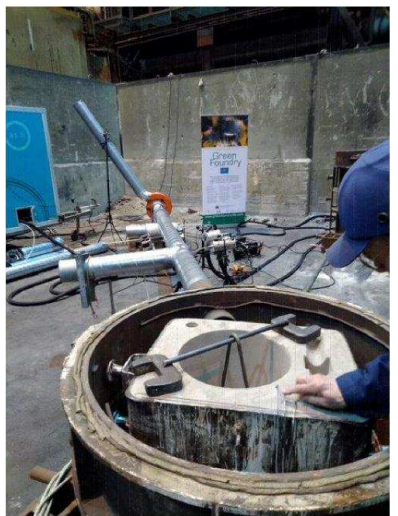
Photo 34. Test mould inside the chamber. The locations of the thermoelements.

The temperature in the foundry was only 15C°. The mould was therefore placed in the furnace for three hours with temperature of 25...32 C°. Thereafter the pattern was stripped from the mould. Next day the mould was placed into the chamber and three thermoelements were located into drilled holes in the mould at the depth of 25 cm and they were at 2,5 cm, 5 cm and 10 cm distance from the steel surface, photo 34.