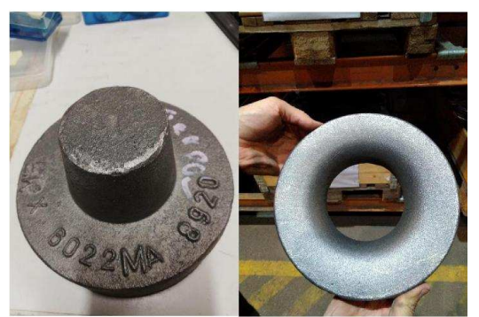
Photo 46. Surface qualities of castings made by inorganic binder nr.3 (left) and Alphaset (right).

Possible defects and cracks were measured by dye penetrant inspection (DPI).