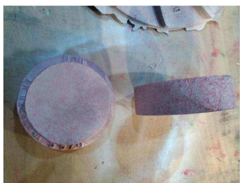
Photo 29. Dye penetrant inspected test castings. No cracks or gas porosity holes existed.