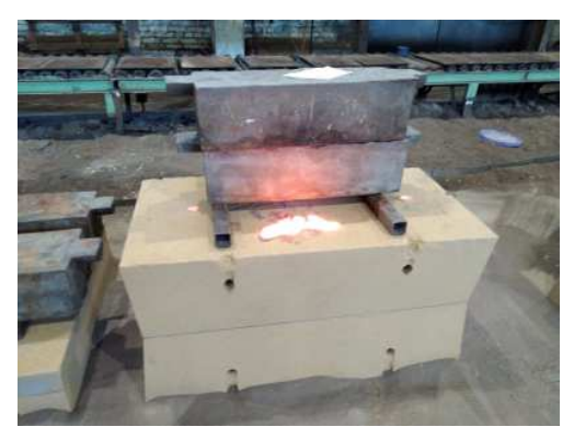
Photo 64. Geopol test mould. No visible fumes were emitted (5 min after pouring).

The fume emissions were negligible also with Geopol moulds, see photo 64.