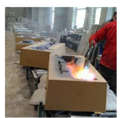
Photo 62. Drying of the coating of Geopol moulds with flame burning.

Several test series were, however, made also with Geopol binder system, with a slower production speed, to allow the moulds to harden enough before stripping. The Geopol moulds were also painted by alcohol-based zircon coatings. The coatings were dried by flame burning, figure 62.