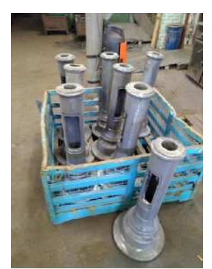
Figure 65. Test casting made by Geopol binder system.

The moulds were broken next day by hand hammering and test castings were cleaned by shot blasting machine, similar way as with Peak's test castings. Surface quality was comparable with castings made by Alphaset moulds. Due to slightly stronger sand sticking longer shot blasting times were needed. Figure 65 shows examples of the test castings made by Geopol binder system.