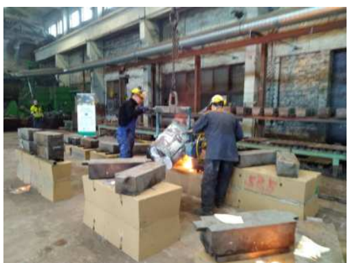
Figure 63. Example of pouring into tested Geopol moulds. Small leakage in one mould, left.

In one mould there was a small leakage between the mould parts, see photo 63. It was expected to be caused by unproper sealing of the mould parts, not by breakage of the moulds.